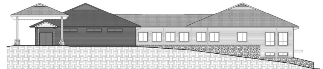
The new Good Samaritan Clinic

Construction of Building 2 is scheduled to begin within the next 3 months. Funds received from the capital campaign have been invested in an interest bearing account while delays have finally been worked out with our attorney and the bond company.